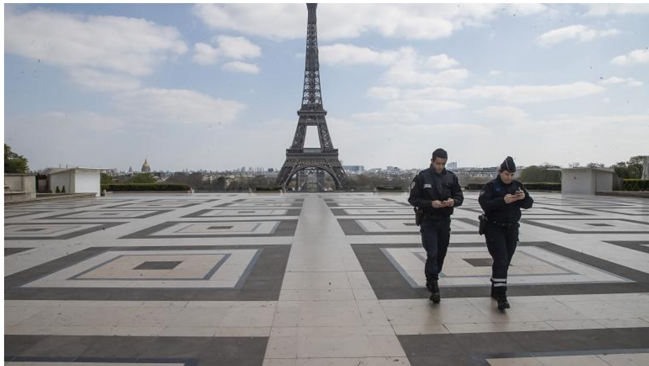
Sites across Paris, including the Eiffel Tower, have been deserted since a lockdown was introduced on March 17.